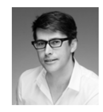
Stéphane Lasserre Principle Architect

The development consists of 3 buildings staggered along an axis that gives a strong direction to the massing. This axis was set in such a way that all the living areas and master bedrooms can face a green open space and the sunset. Since the towers form an angle with the main roads, it creates a dynamic experience as the character of the development will change depending from where we look at it.