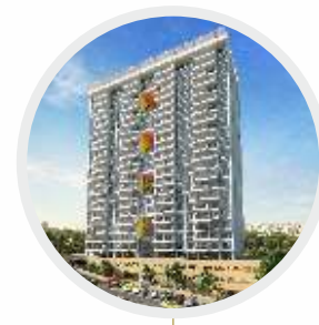
NEW TOWERS AT CLOVER HIGHLANDS